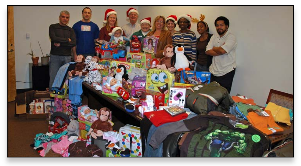
Clayton State's Angel Tree Santa's Helpers

The Kohl's department store, located in Fayetteville, Ga., generously supports this