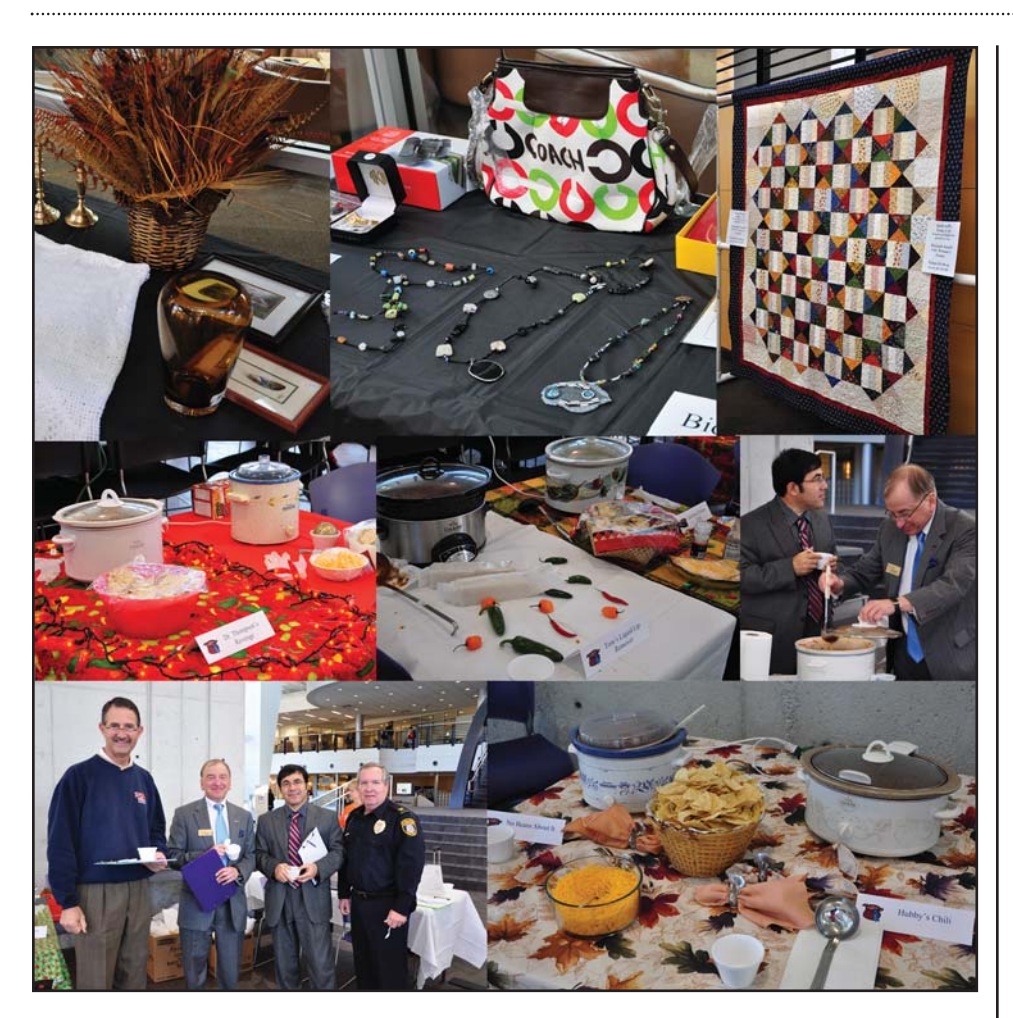
2009 Women's Forum Auction & Chili Cook-off