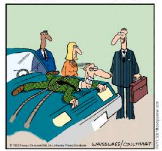
"Sorry, Henry, maybe the car pool won't be so crowded tomorrow."