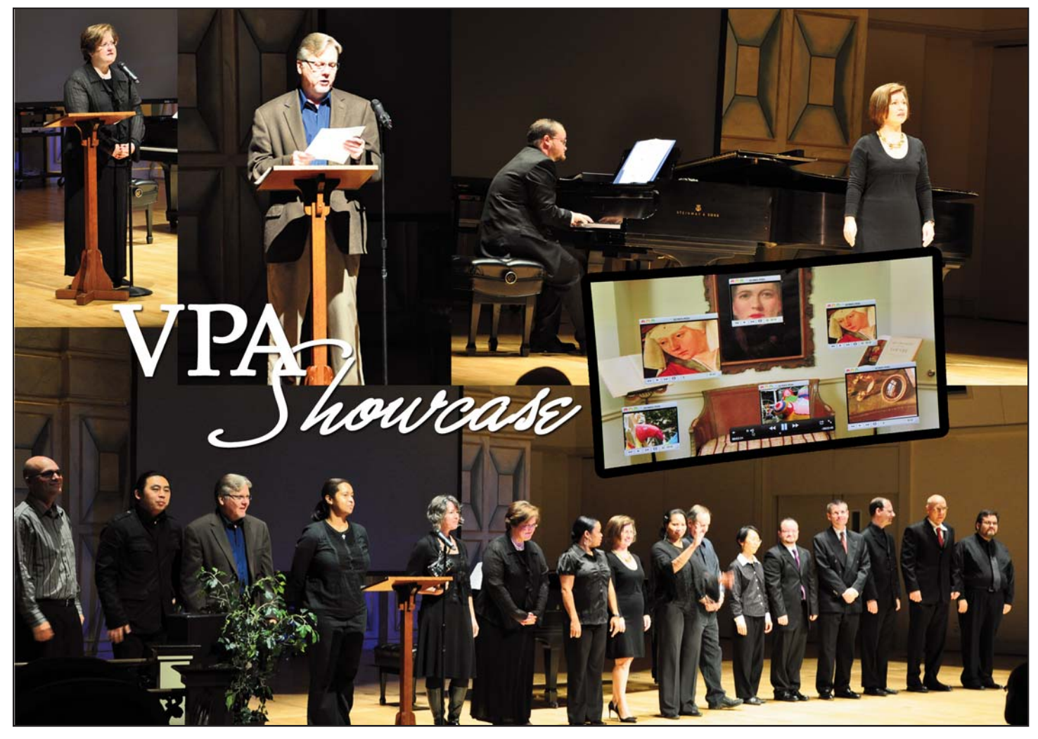
The College of Arts & Sciences Department of Visual & Performing Arts held their first VPA Showcase in Spivey Hall on Thursday, Oct. 29.

"Aside from modern theatre and Shakespearean theatre, the biggest contributors in theatrical history are the Greek comedies and tragedies," he says. "This comedy has an all-student cast, and will allow theatre majors — and audiences — to see that Greek theatre is closer to modern comedy than they may think."