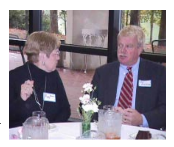
Retired, but not retiring...

The cost of the luncheon is $15 per person, and retirees are encouraged to bring a guest. In addition, an opportunity to join the association will follow the luncheon. Yearly dues is $15, which contributes to the cost of mailings and minor expenses associated with the luncheons.