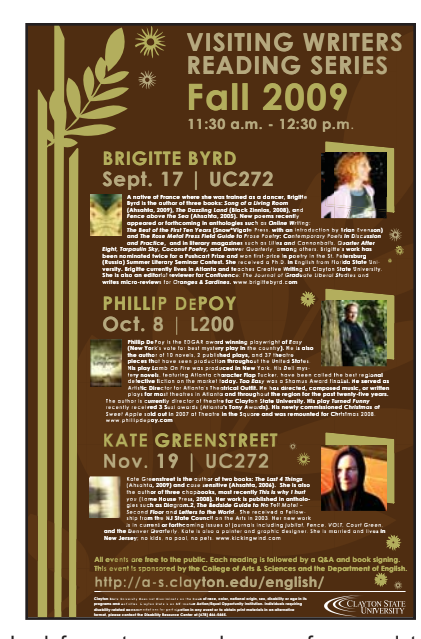
Look for posters around campus for more details

press.boisestate.edu/subscription.htm), "The Last 4 Things." For more, go to http://www.kickingwind.com/. ■