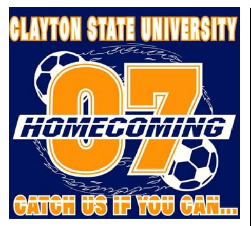
2007-08 Homecoming Design

The 2007-08 academic year at Clayton State is off to a fast start in what promises to be a historical year with the construction of three new buildings and the addition of several new academic programs.