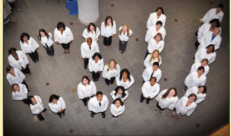
Students take a break from their luncheon to show school spirit.