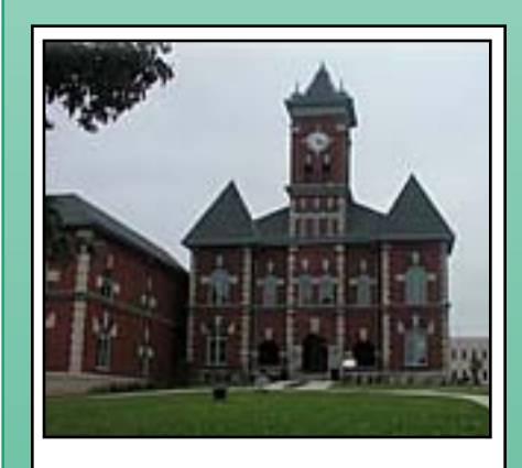
Visit <u>www.JonesboroGa.com</u> for additional infomation

Sponsored by the City of Jonesboro and the Jonesboro Downtown Development Authority, with partial funding from Arts Clayton and the Grassroots Arts Program.