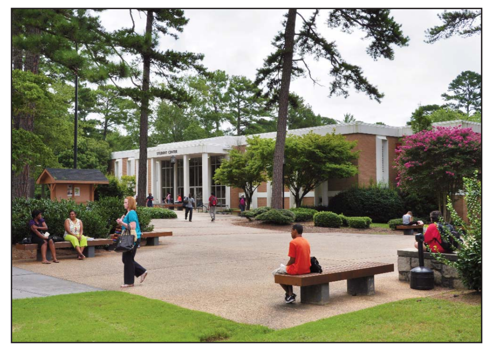
Students taking morning courses make their way to class on the first day of fall semester.

Come to Career Services every Wednesday between 10 a.m. and 2 p.m. Bring a printed copy of your resume. Remember, first come, first served.