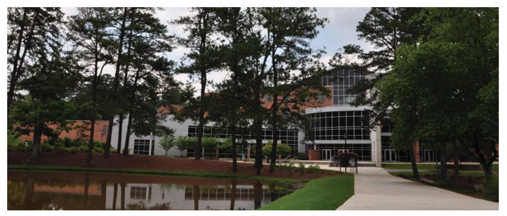
Summertime 2009 at Clayton State University