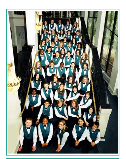
Spivey Hall 50 Voice Tour Choir

The Spivey Hall Children's Choir has two CDs. To order call (770) 960-4200 or email spiveyhall@clayton.edu. CDs are $15 each.