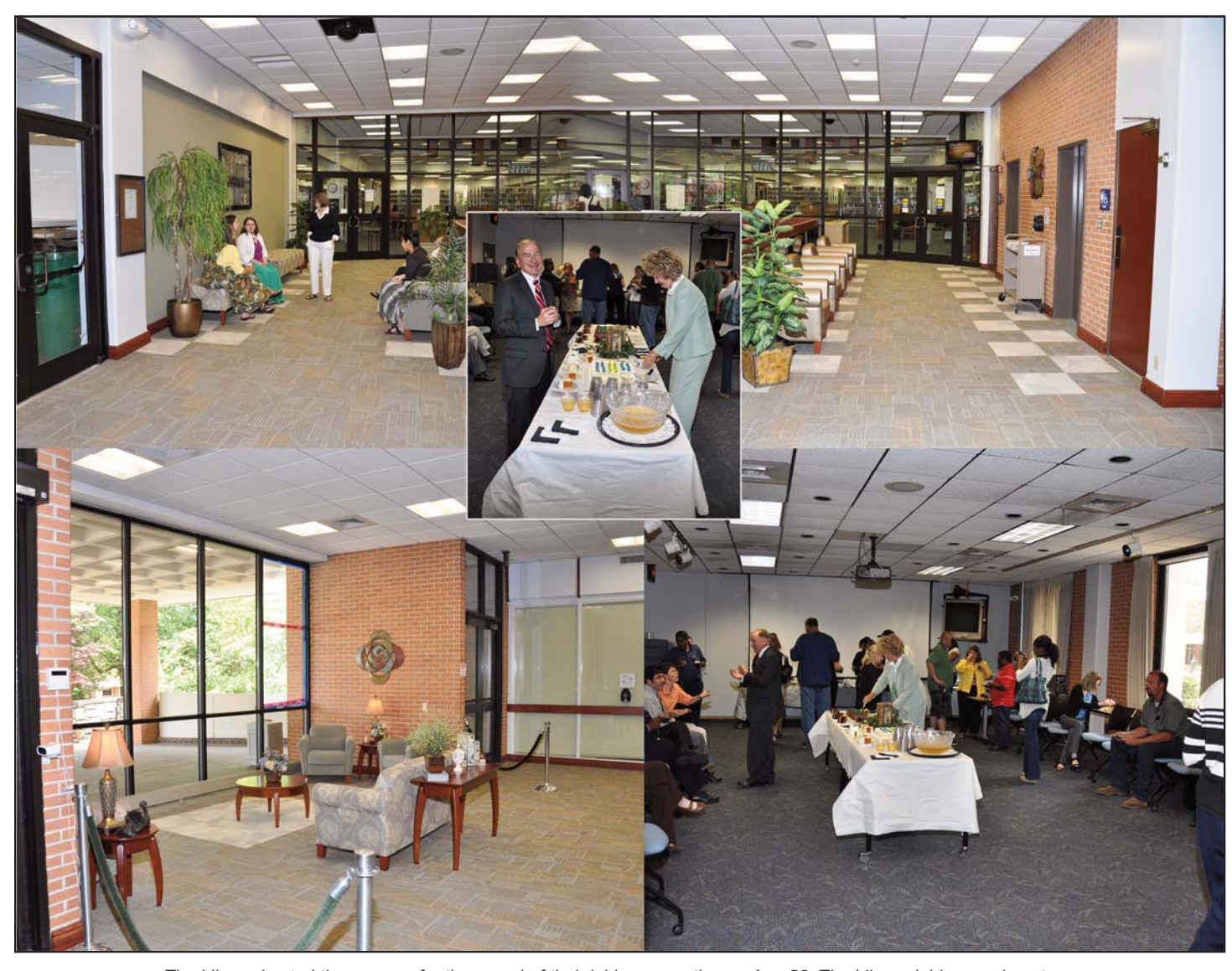
The Library hosted the campus for the reveal of their lobby renovation on Apr. 26. The Library lobby now boasts a new color scheme, new decor, new carpeting, new furniture and energy efficient windows.