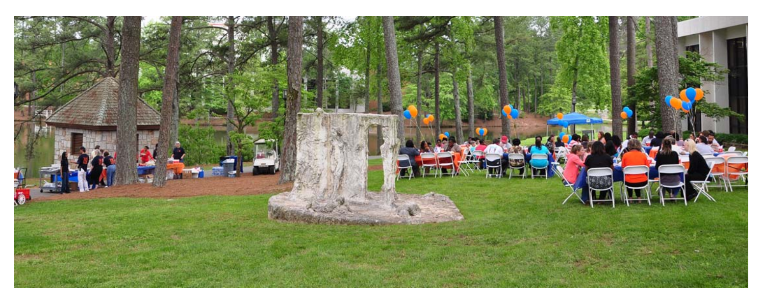
Clayton State staff enjoy the 2009 Staff Appreciation Day festivities.

"I wanted to do something different, in a larger community," he says. "Training in the University setting has been good because it's a very mature setting."