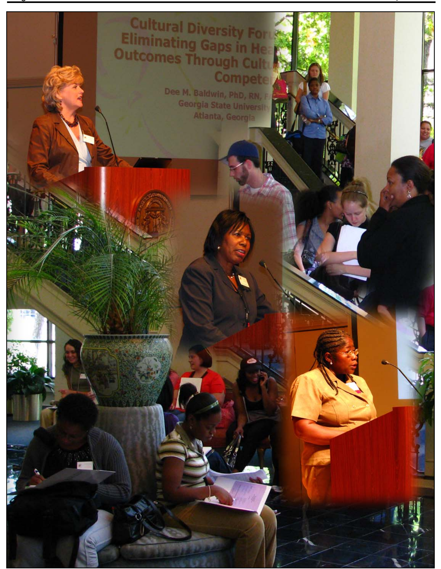
School of Nursing's spring Cultural Diversity Forum