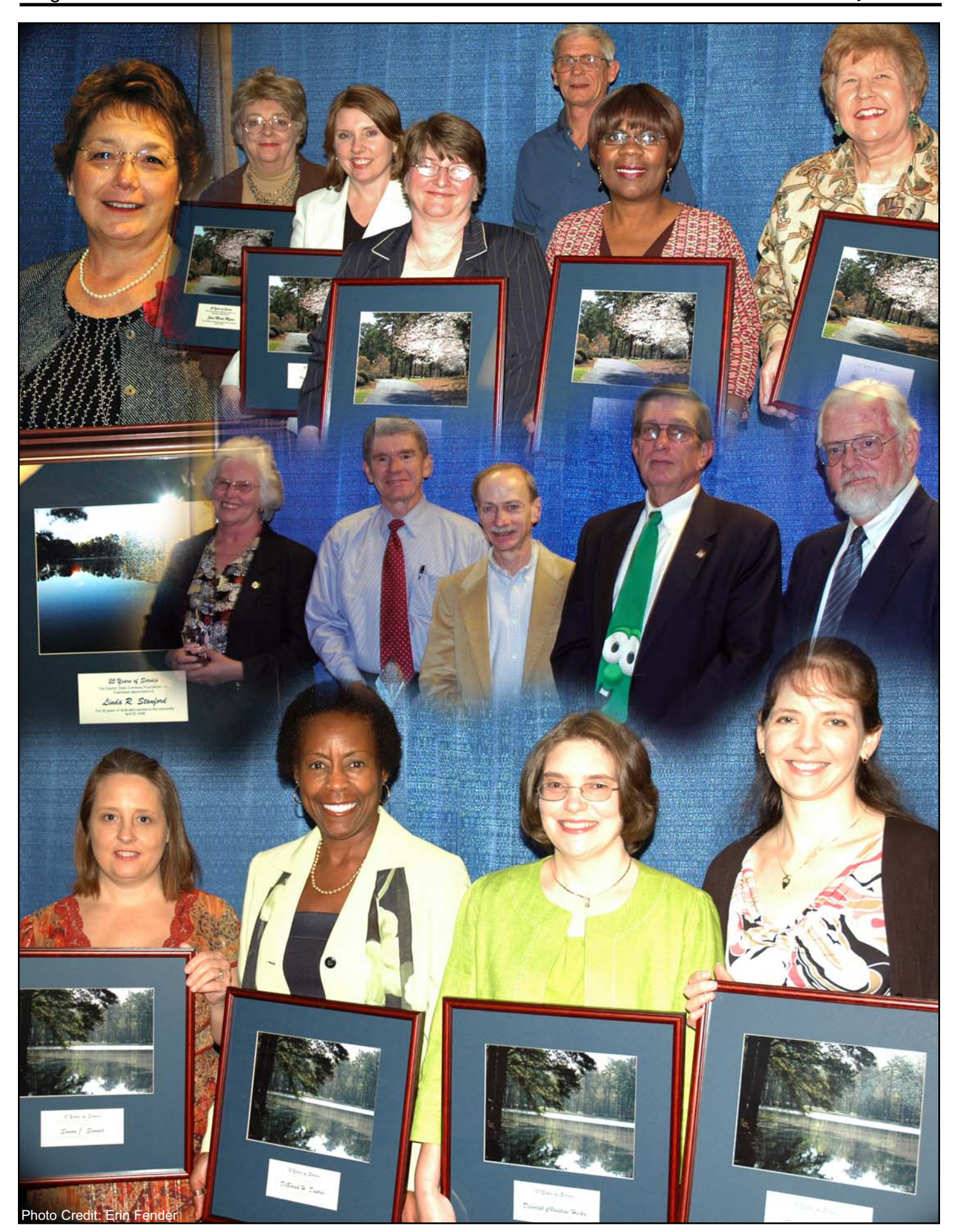
2008 Service Awards Recipients