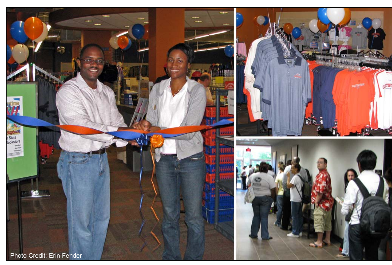
Bookstore Grand Opening in the Student Center

During Summer Break the Clayton State Library is closed the following weekends: May 10-11; May 17-18; May 25-26. Operating hours during the break are as follows; May 12 – May 16 – 8 a.m. to 5 p.m. May 19 – May 23 – 8 a.m. to 5 p.m. Summer Hours begin on May 27... Monday – Thursday: 7 a.m. to 9 p.m.; Fridays – 7 a.m. to 5 p.m. Closed Saturday. Sundays – 1 p.m. to 6 p.m. Library will be closed July 4-6, in celebration of Independence Day.