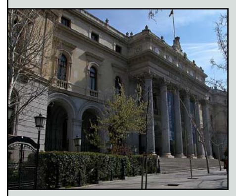
Spain's Prado Museum