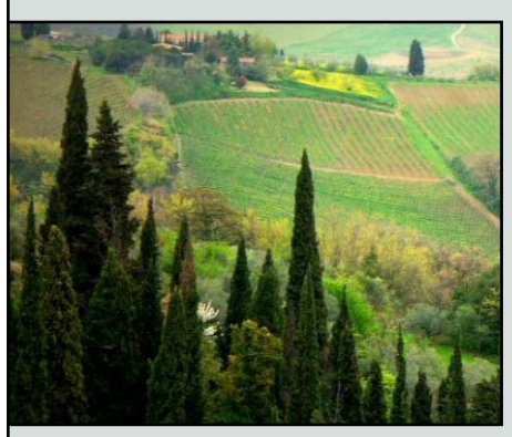
Tuscany in Italy

Clayton State University's Division of Continuing Education, together with Collette Vacations, is offering a wealth of exciting traveling opportunities for 2007 and 2008. Travel to Italy, Greece, Spain, or Ireland and Scotland and experience the culture, cuisine and history of these beautiful countries.