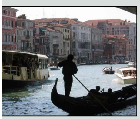
Venice in Italy