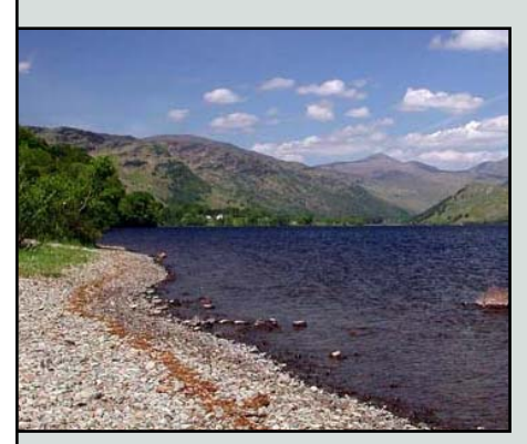
Loch Lomand in Ireland