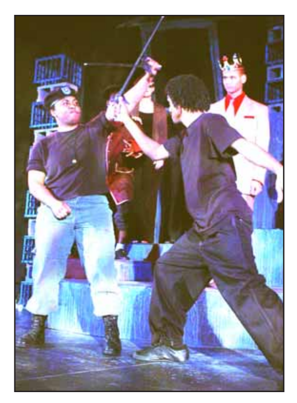
Student actors in the Clayton State Theater fall 2004 production "Hamlet the Musical!" engage in stage combat.

Clayton State's Theatre Society and Opera Production class has joined forces to participate in a six-week, intensive stage combat workshop to help add a little more action – and camaraderie – to their craft.