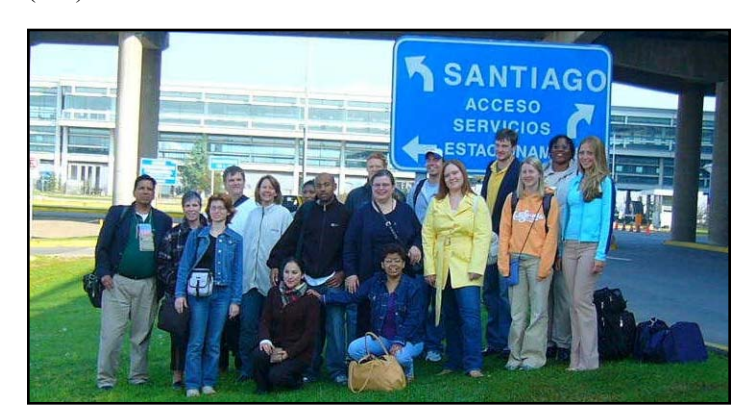
The 2005 participants in a study abroad seminar to Chile.

More information on initial deposit etc., can be obtained from Rajgopal Sashti, <u>rajgopalsashti@clayton.edu</u> or (770) 438-1604 or (404) 550-4805. ■