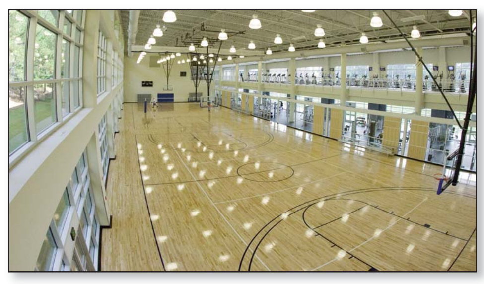
A view of the courts in Clayton State's new Student Activities Center.

For further information, contact Lauer at (678) 466-4974. ■