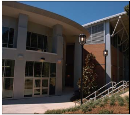
Student Activities Center

a benefit auction. Attendees will have the opportunity to tour the new facility.