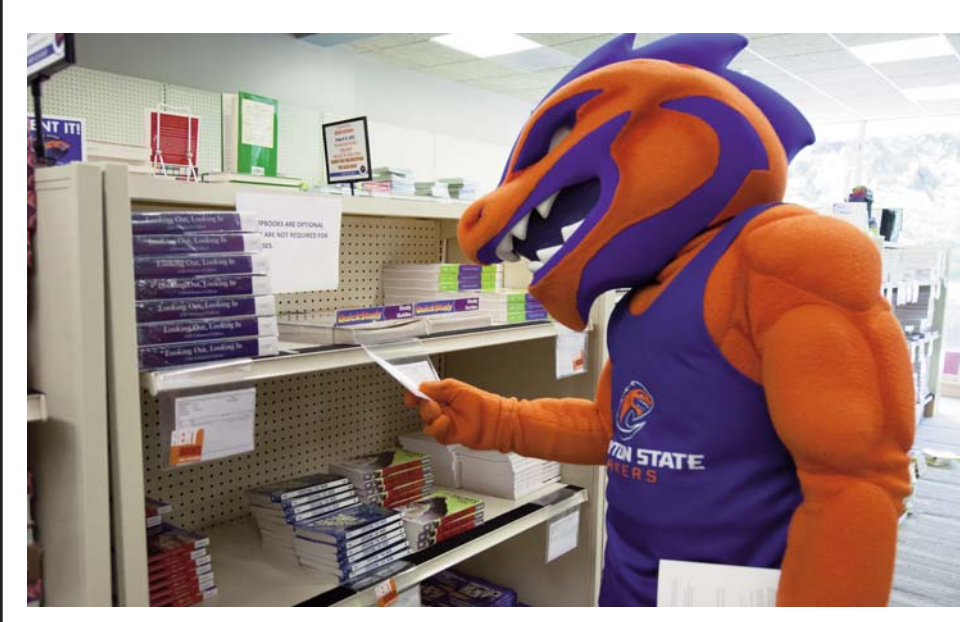
Loch shops the Loch Shop in-store and online at www.claytonstategear.com.

run monthly promotions (the current one is a gift with a $50 purchase) throughout the year as well. ■