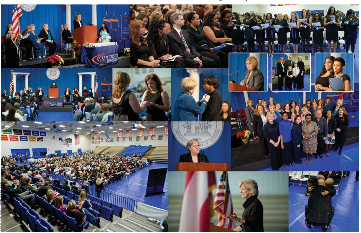
Fall 2012 Nursing Pinning Ceremony