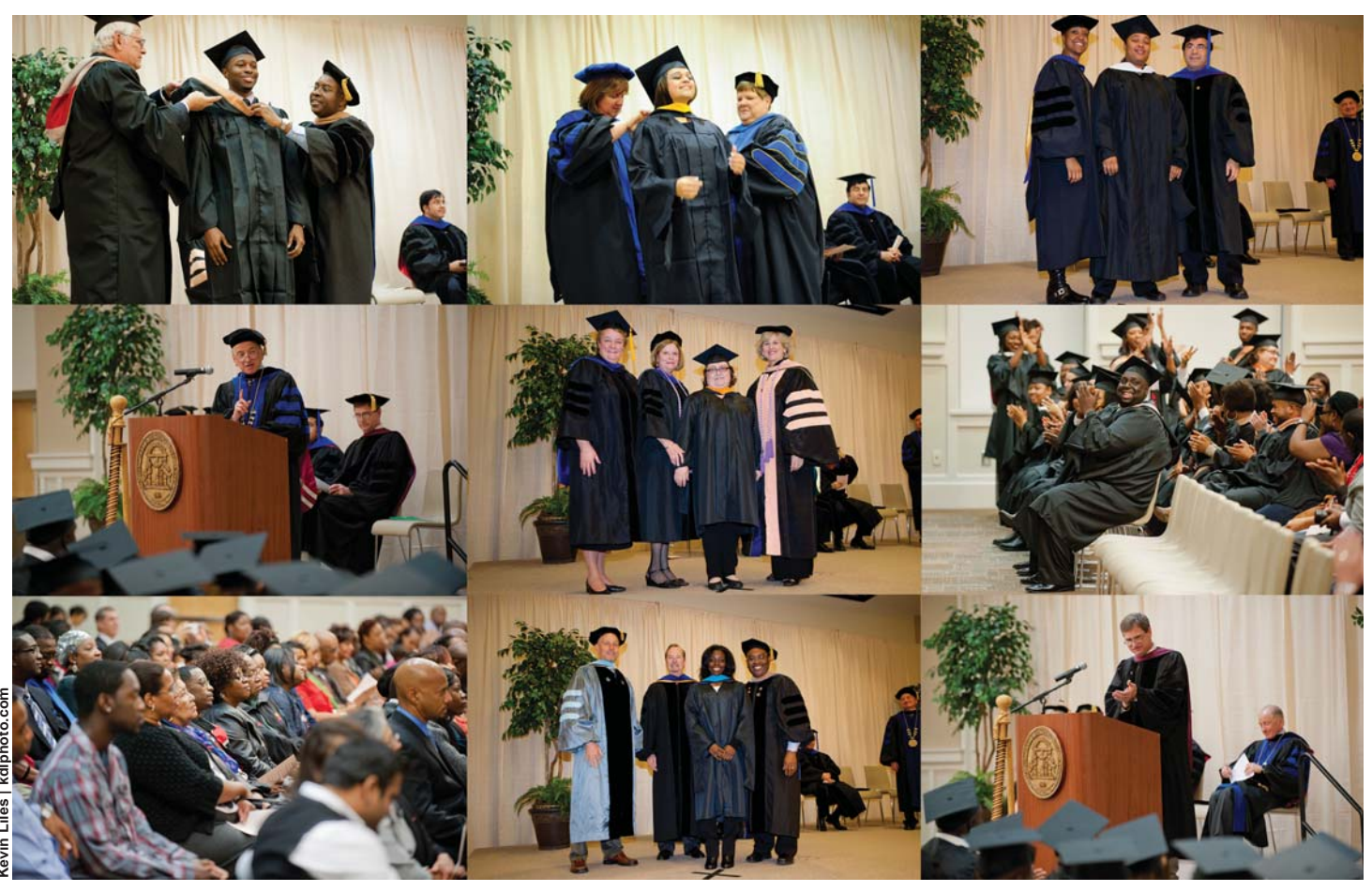
Fall 2012 School of Graduate Studies Hooding Ceremony