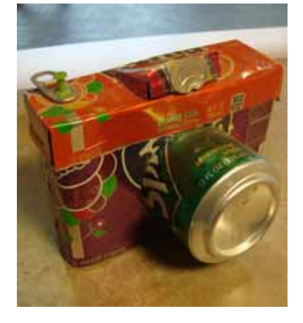
Ist Place: "My Candid Camera" by Aaron Panlilio (Jonesboro)

Other Earth Week initiatives included; Grounds for Growth (using recycled coffee grounds for composting), the Choose To Reuse Discount (35 cents off anyone using their own travel mug for a drink), Lights Out (the Lakeside Dining Hall went without lights for a day), and PB&J Day. ■