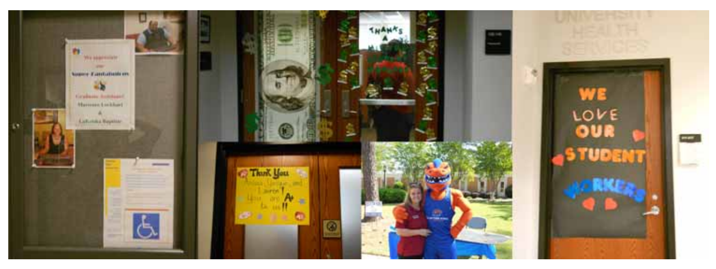
Thank you, student workers! National Student Employment Week photos. See story on p. 4