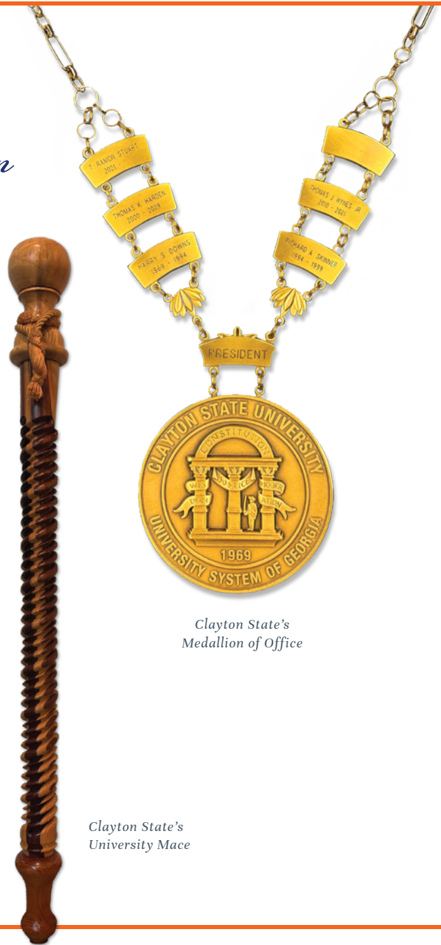
Clayton State's Medallion of Office

The Medallion of Office bears the seal of Clayton State University. The university's seal contains an outline of the seal of the State of Georgia with the inscription "Constitution, Wisdom, Justice, Moderation, 1969" in the center and "Clayton State University" and "University System of Georgia" circling the edge.