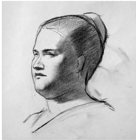
3. Keep the contrast between light part and shadow. Adjust the proportion and contour of detail. keep the drawing simple and as accurate as possible.