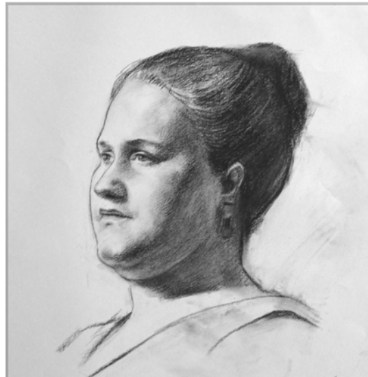
4. Still keep the integral contrast. Adjust detail and integral proportion.