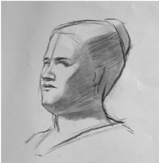
2. Adjust Contour, Perspective and proportion. Divide the object into two parts--Light and Shadow. Keep the shading simple. Keep the contrast.