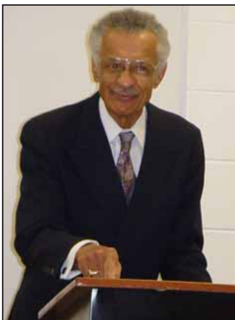
Civil Rights leader C. T. Vivian speaks to Minorities in History class.

Vivian has held positions with the Southern Organizing Committee Education Fund, the Southern Christian Leadership Conference (SCLC) the Black Action Strategies and Information Center (BASIS), and the Center for Democratic Renewal. He continues to be a voice for civil rights across the country and around the globe. ■