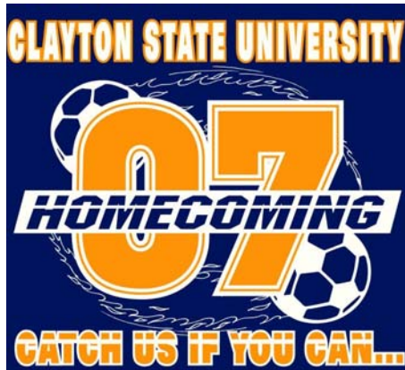
2007-08 Homecoming Design

The 2007-08 academic year at Clayton State is off to a fast start in what promises to be a historical year with the construction of three new buildings and the addition of several new academic programs.